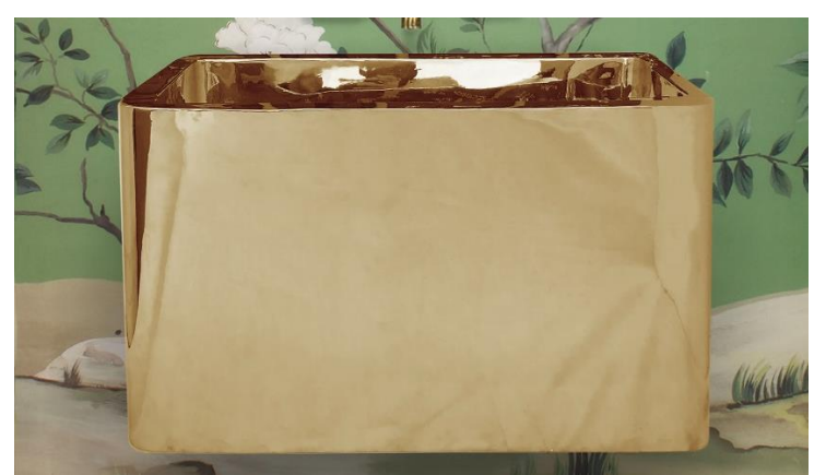
Shown in PB finish