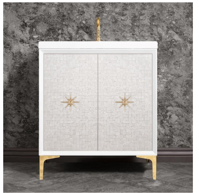
Shown in PB