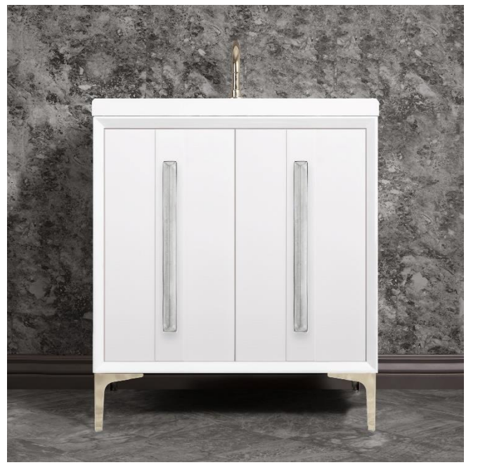
Shown in PB