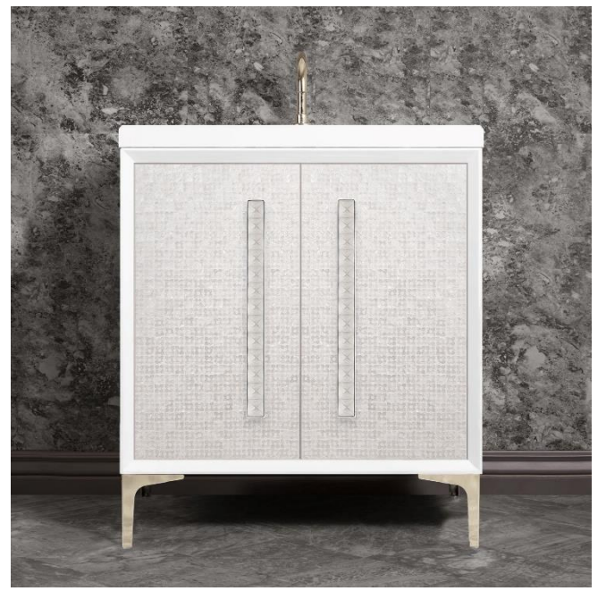
Shown in PN