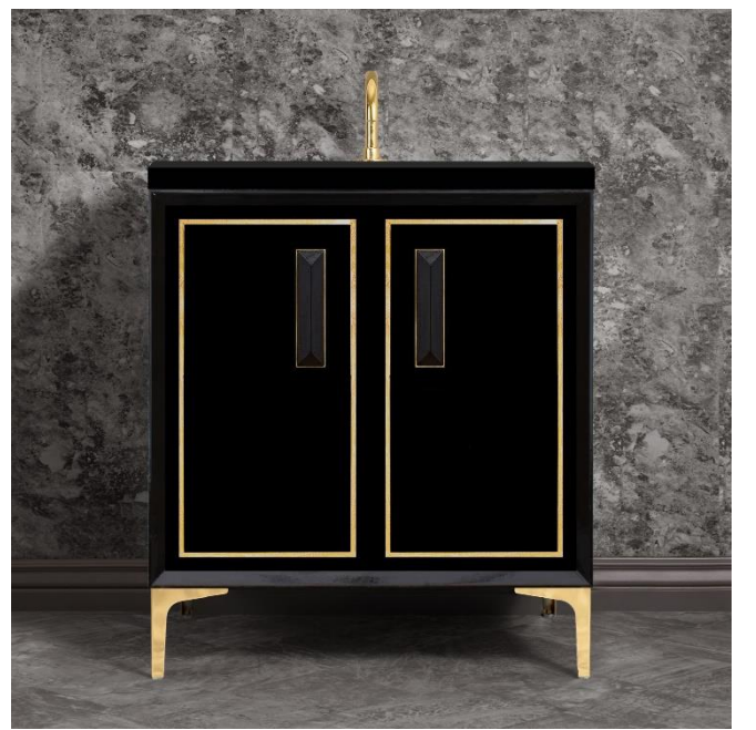
Shown in PB