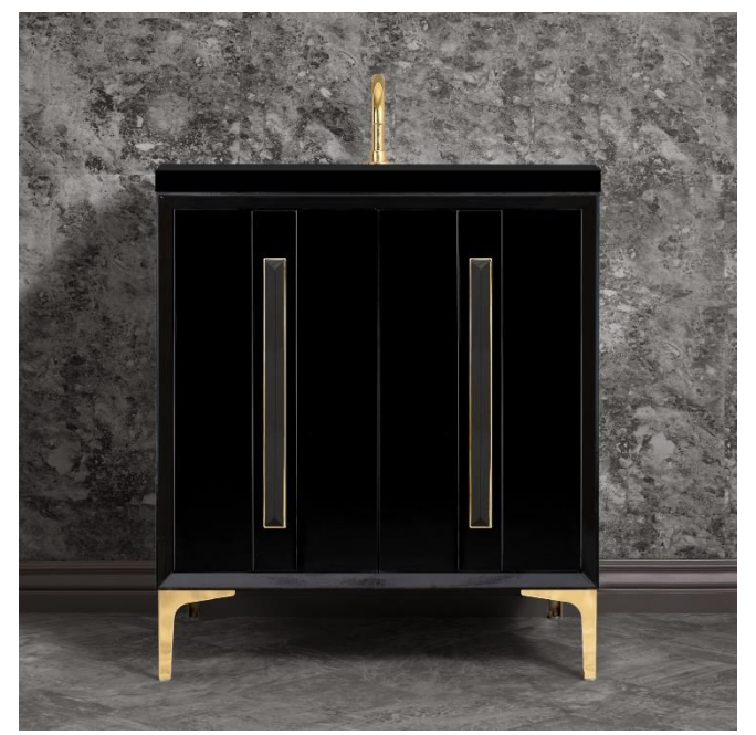
Shown in PB