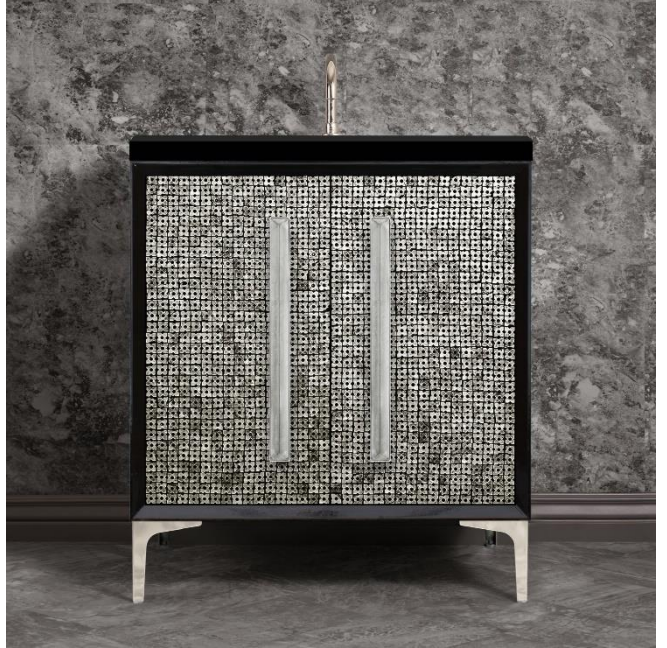
Shown in PN